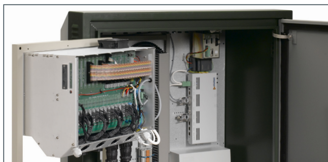
ITC-2: mounted in a cabinet equipped with a swing frame allowing easy access to the back-side of the unit