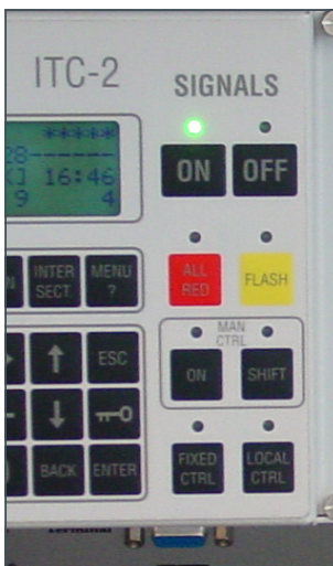
ITC-2: Compactly designed SWARCO ITC-2 with 16 signal-groups

The controller can be delivered in three different sizes depending on the number of signal groups required. For normal intersections the 3U rack with 16 signal groups and 32 detectors will be suitable. For larger intersections, or for covering more than one intersection, there are versions with 32 and 64 signal groups and 80 detectors. ITC-2 is designed for any climate and is installed worldwide, from the cold Nordic to the hot Middle East and Africa regions. The larger cabinet is equipped with a swing frame allowing easy access to the backside of the unit. The controller has been developed according to European and national standards.